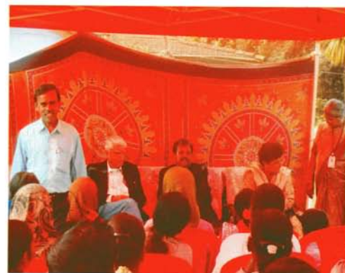
Deepavali Celebration at CCC

Every PLHIV is followed up after their discharge from the CCC and assisted with social care which ensures enjoyment of their fundamental rights, right to Life and Dignity and getting welfare services from the Government system.