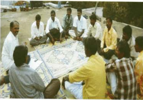
Environmental Protection Group with open membership to CBOs and environmental activists. Island Trust

receives funding support from TAMWED, a UK based NGO ( www.tamwed.org ) for Climate Change activities since 2009.